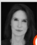
Katrina vanden Heuvel