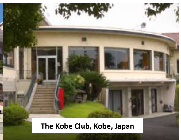
The Kobe Club, Kobe, Japan