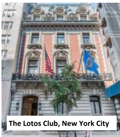
The Lotos Club, New York City

Unlock the doors to over 300 clubs worldwide. Travel knowing you can dine, entertain and stay at fellow clubs that have been vetted and uphold the most discerning of service standards. From fellow clubs here in Ontario and in Canada, to the most exclusive clubs in Europe and Asia, and numerous others throughout the United States and South America, all you need is your letter of introduction from our Front Desk Reception@UClubToronto.com