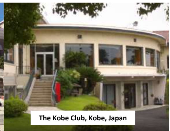
The Kobe Club, Kobe, Japan