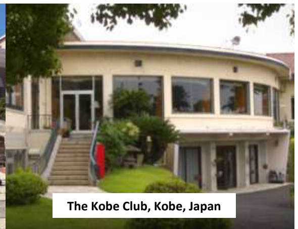
The Kobe Club, Kobe, Japan