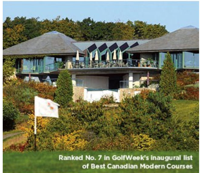
Ranked No. 7 in GolfWeek's inaugural list of Best Canadian Modern Courses